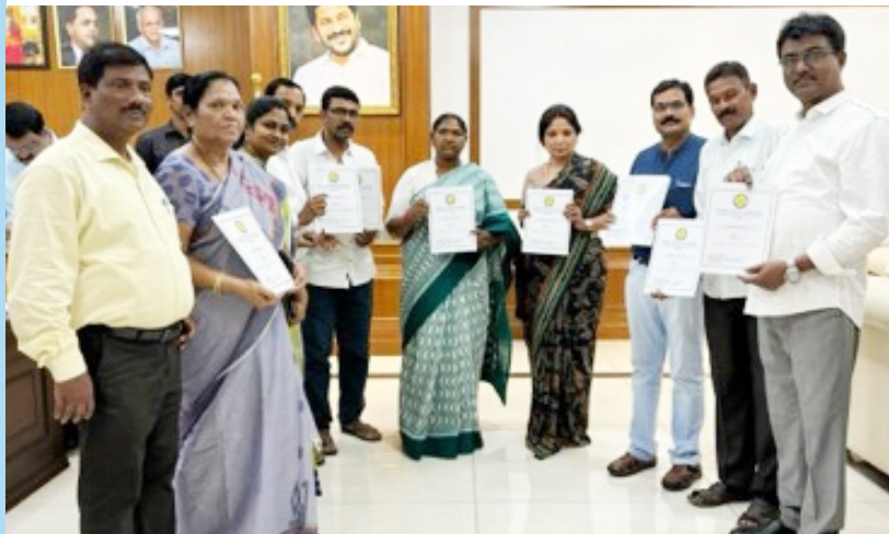
UVARD EC Members with State Minister Seethakka Garu at Telangana Secretariat.

18 June: Meeting conducted on DDRS Grant in Aid at the UVARD Secretariat office by EC Members with registered federation members.